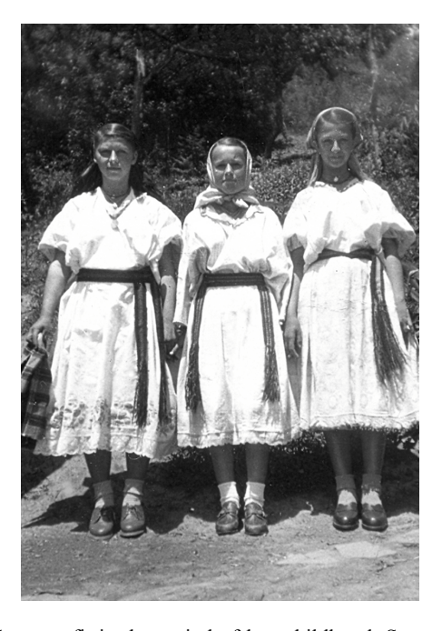
Illustration 4. Female Croat outfit in the period of late childhood. Source: A. Tufekčić, Osnove etnopedagogije... , op. cit., p. 182.

hood was when their parents bought them their first rubber shoes. It was as emotional as getting their first pants.