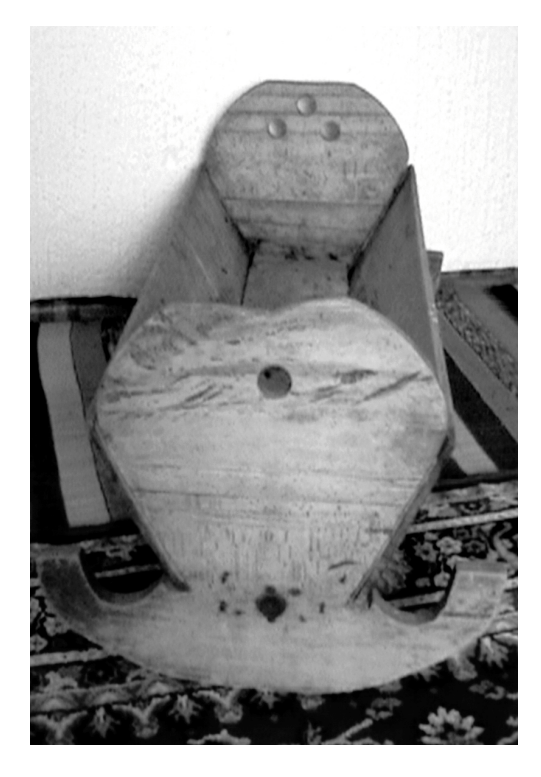
Illustration 1. Bešika.

child will sleep better because of it. Beside this, in Orthodox populations especially, one or two garlic cloves were put in the cradle, as well as the wrapped up umbilical cord part had fallen off.