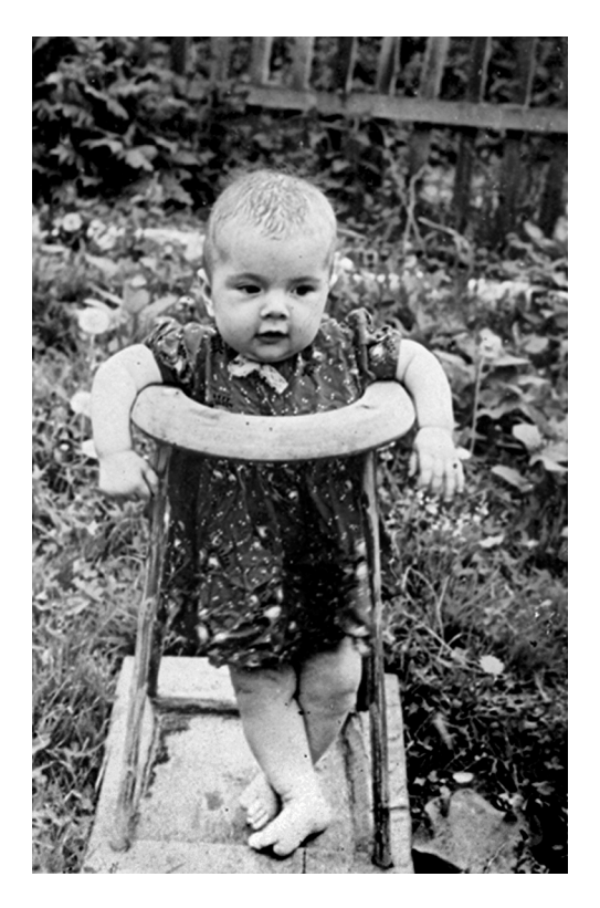
Illustration 2. Child in dubak. Ilustracja 2. Dziecko w chodziku.

out and felt her child's legs transform from lipove to drenove in the very act of walking slowly and with joy. It can be easily said that this pattern of upbringing may serve as an ideal when we talk about pragmatics, gradual approach, the sense of what is too early or too late in nurturing activities. On the other hand, it can be implied how much we are adrift from that ideal when we "support" the process of children's learning to walk with contemporary so-called walkers with wheels, where children learn to walk without ever falling and their mothers never notice the change from lipa to dren in their children's legs.